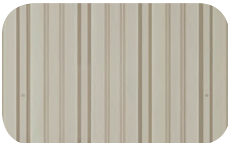
The Butlerib II wall panels are 3 feet wide and up to 40 feet in length, so wall installation can be completed quickly—even on large buildings.

Each Butlerib II wall system panel and supporting structure is available factory punched to assure precision and speed in the installation process.