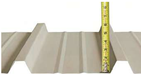
The Butlerib II wall panels feature a 1½" corrugation for additional strength.

Butlerib II wall panels feature a full 1½-inch-deep corrugation for a clean, simple appearance and added strength. The panels are also available in a variety of material thicknesses, enabling you to balance the building's performance requirements with budgetary constraints.