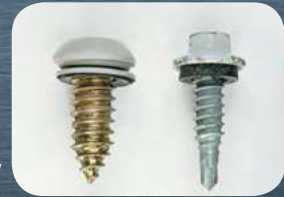
Butler Scrubolt Others

The Butler Scrubolt™ can be specified for panel-to-structural connections vs. industry standard fasteners.