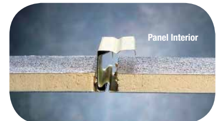
eStylWall panels lock together concealing fasteners and providing fast installation and a uniform exterior appearance.